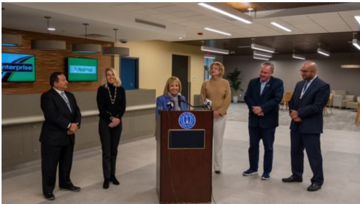
Town of Islip officials inside the new Ground Transportation Center at MacArthur Airport.